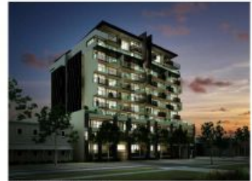
EXTERNAL BUILDING ARTIST IMAGE