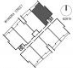
PLAN KEY - TOWER