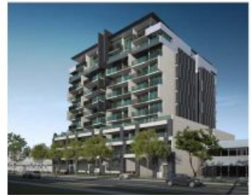
EXTERNAL BUILDING ARTIST IMAGE

COMO APARTMENTS RESIDENTIAL APARTMENT DEVELOPMENT 41-53 WYNDORA STREET, TENERIFE QLD 4308