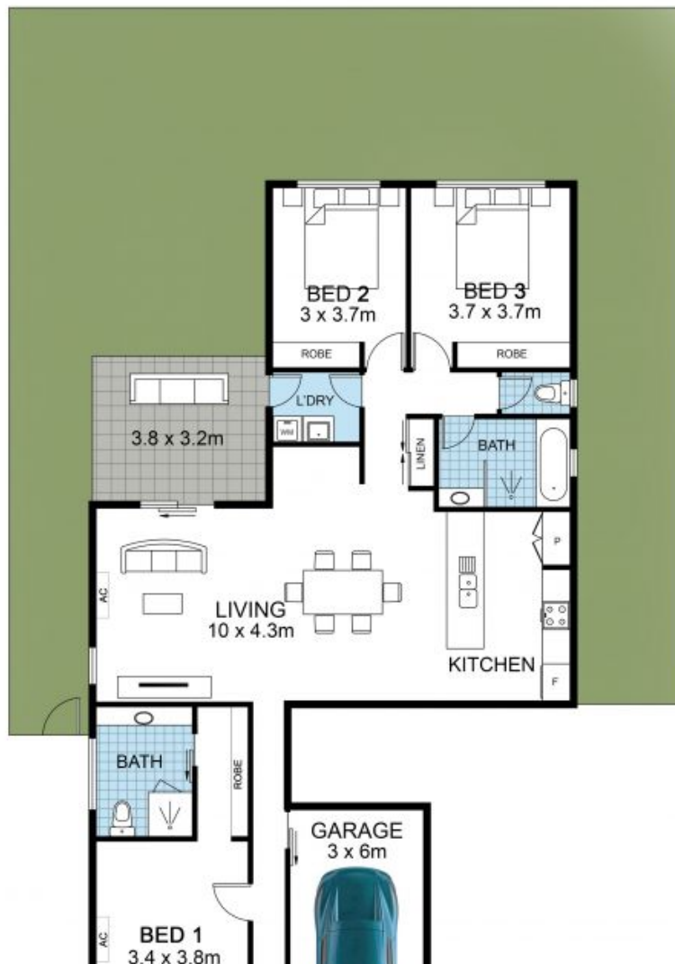
Dual Key Living